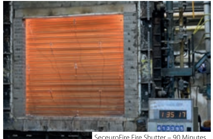
SeceuroFire Fire Shutter – 90 Minutes