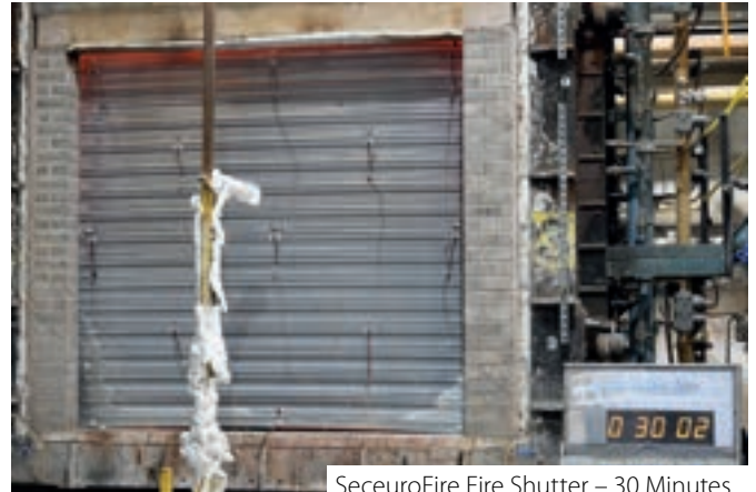
SeceuroFire Fire Shutter – 30 Minutes

The SeceuroFire Fire Shutters were tested and assessed by Warringtonfire. The product is fitted on the furnace side replicating the most severe condition and the temperature of the furnace is increased to 1200°C at a rate defined by the product standards.